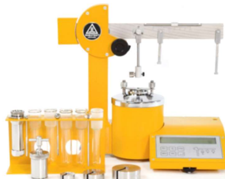
BALL PRESSURE RHEOMETER HPPPLER® KD 3.1