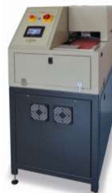
Sample Preparation Machines