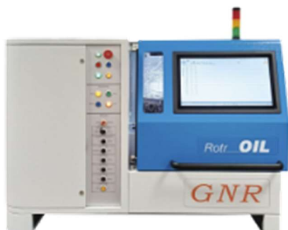
R4 - Rotroil (Automatic Oil Analyzer)