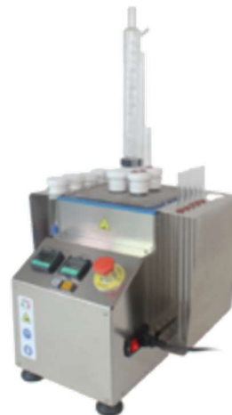
Block Oven Aging Check