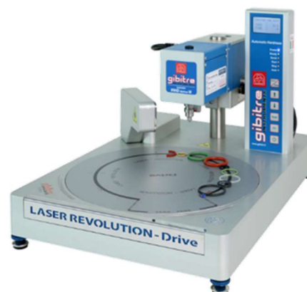
Laser Revolution Hardness Check - Drive