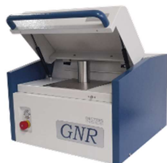
AreX Bechtol Diffractometer