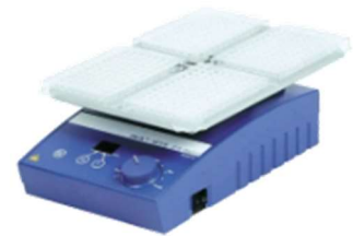
DIGITAL MICROTITER SHAKER