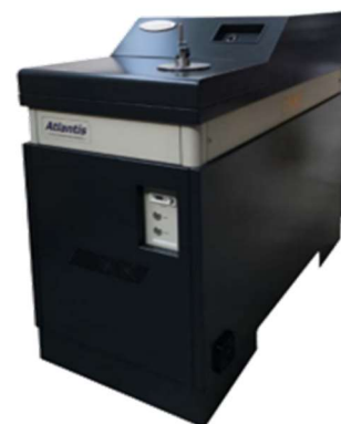
S9 - Atlantis OES