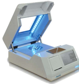
ElvaX RoHS (Petroleum)