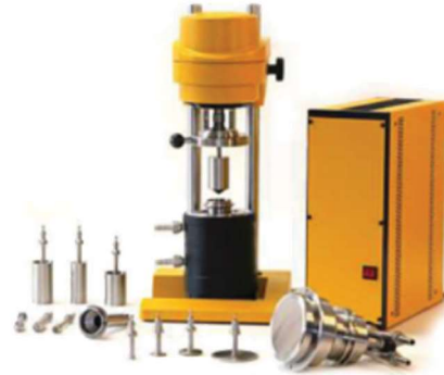
DSR RHEOMETER RHEOTEST® RN 5.1