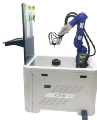
Stress X- XRD mounted on 6-axis robot