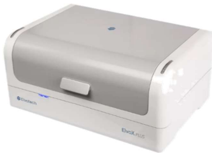
Benchtop Spectrometer Range (Basic, Pro, Plus)