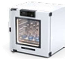
HEATING / COOLING / TEMPERING