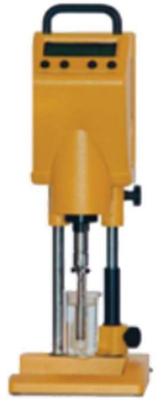
CAPILLARY RHEOMETER RHEOTEST® LK 2.2