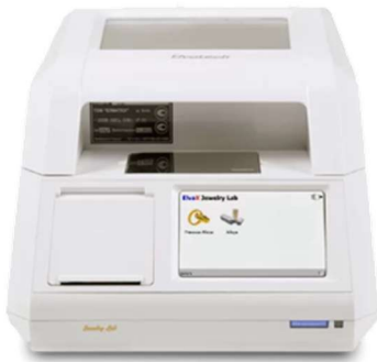
ElvaX Jewelry lab