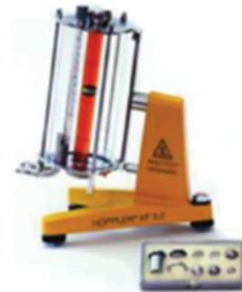
FALLING BALL VISCOMETER HÖPPLER® KF 3.2