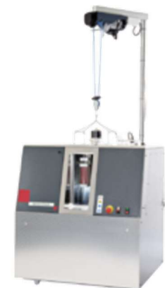
Ozone Check UV