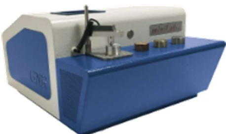
Spark Emission Spectroscope

GNR SRL provides advanced elemental analyzers, including OES, XRF for precise metal analysis. The XRD offers detailed crystalline structure insights, while metallurgical microscopes enable accurate material characterization. These technologies ensure reliability for industries like steel, aluminum, petrochemicals, and more.