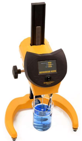
RHEOTEST VISQI N° 1