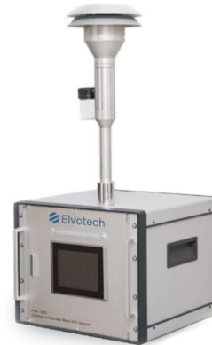
Particulate Matter Monitoring System