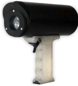
Mining & Exploration