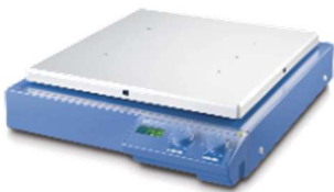
RECIPROCATING & ORBITAL SHAKER