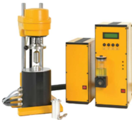
ROTATIONAL RHEOMETER Bitumen rheometer RHEOTEST® RN