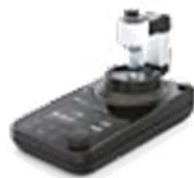
ELECTROCHEMISTRY FLOW CHEMISTRY